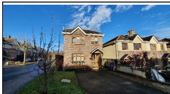
Greystones/Delgany, County Wicklow

House No.7 - Detached House - 2004 - Block (Unknown) Construction - 115.38m 2 (1241ft 2 )